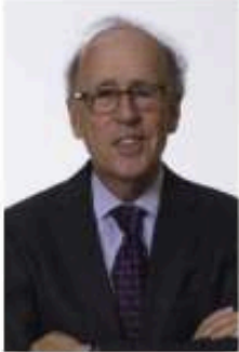
Stephen Roach Senior Lecturer at Yale School of Management; Former Chairman of Morgan Stanley Asia